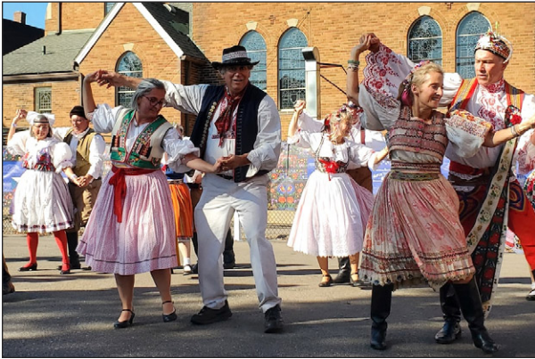
Saint Paul Czech and Slovak Folk Dancers delighted the crowds at the end of the festival.

We also thank all who attended and helped to make this event such a total success. It was truly a great day for our Czech and Slovak community, friends, and the West 7th Street area.