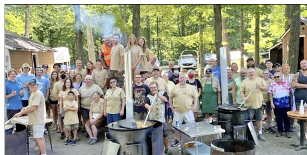
Booya picnic volunteers at Minnesota Sokol Camp.

The picnic begins at noon on August 10, with booya and other food