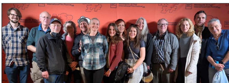
Some of the many cinema fans who enjoyed the Czech and Slovak films