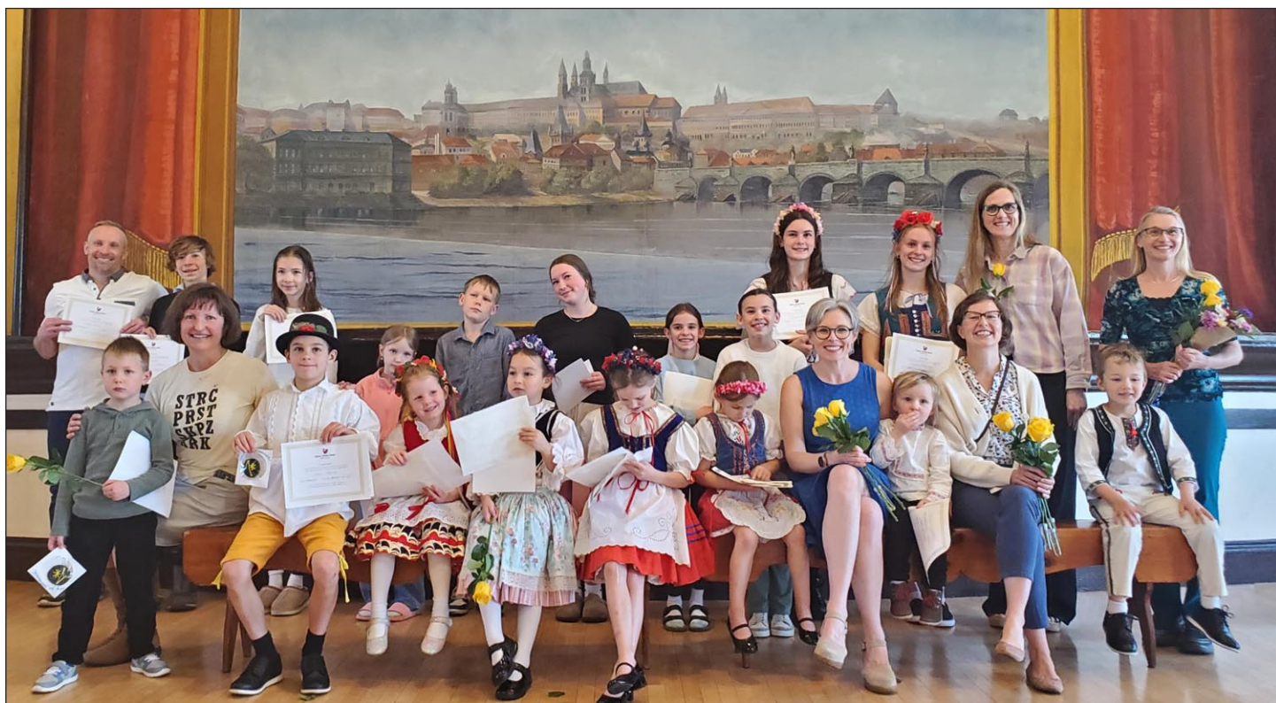
The Škola students and their teachers.