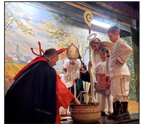
Svatý Mikuláš , anděl (angel), and čert (devil) with two good children.

Then it was time for the highlight of the evening, the visit of Svatý Mikuláš , along with a lovely anděl (angel) and trickster čert (devil). Each child went home with an overflowing bag of candies, games, and activities, plus a chocolate-filled Advent calendar.