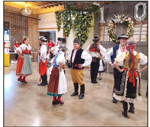
St. Paul Czech and Slovak Folk Dancers