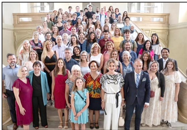
Poděbrady 2023 students from around the world, teachers, and program administrators

Culture lectures or activities took place in the afternoon. Since there were so many Spanish-speaking students, the culture lectures were translated from Czech to both English and Spanish. Culture instruction included field trips to the Bohemia Glass Factory located right in Poděbrady, Radio Prague, Terezín, Kutná Hora, Sedlec Ossuary (the Bone Church), a skanzen (open-air museum) in Přerov nad Labem, the confluence of the Elbe and Vltava rivers in Mělník, and the Devil heads sculptures in Želízky.