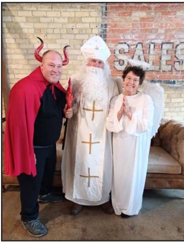
St. Nicholas ( Svatý Mikuláš ), Angel ( Anděl ), and devil ( d'ábel )