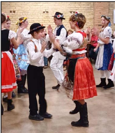
Sokol Minnesota Children's Dance group

Montgomery held its 2nd Annual Svatý Mikuláš Celebration on Sunday, December 3, 2023. There were over 200 in attendance.