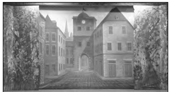
Above: The Clock Tower, the back backdrop, is the smallest and rarely used. Left: A circa 1920 playbill.

Vic Hubal, Sr., painted three of the six beautiful stage backdrops in 1932. The unique "fly" (raise and lower) system of pulley and rope is hand operated, an historic rarity; only the front backdrop of the Charles Bridge in Prague has a counterweight to make the task easier. The Sokol Minnesota stage also has two sets of "splatter flats." The "cool" (grey) and "warm" (beige) sets are 10 feet tall with nine pieces: three are 4.5 feet wide, two at 36 feet, two "door" flats at 4.5 feet; one window with screen (only in Minnesota). Unlike modern hinged sets, these are lashed together to form sets. The Sokol stage scenic properties also include one roofed cottage, several flats of brick, and three trees.