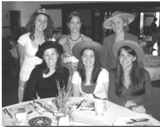
Sokol Tea Party Guests

Forty-eight lovely ladies and four very sweet girls had a delightful afternoon last month annual Sokol Tea Party Social at the CSPS Hall.