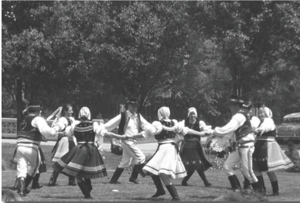
Minnesota’s Slovak Lipa Folk Dancers