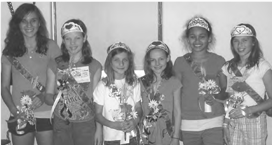
Another optional activity for campers was the Miss Poppy-seed contest, in which all the girls were winners!