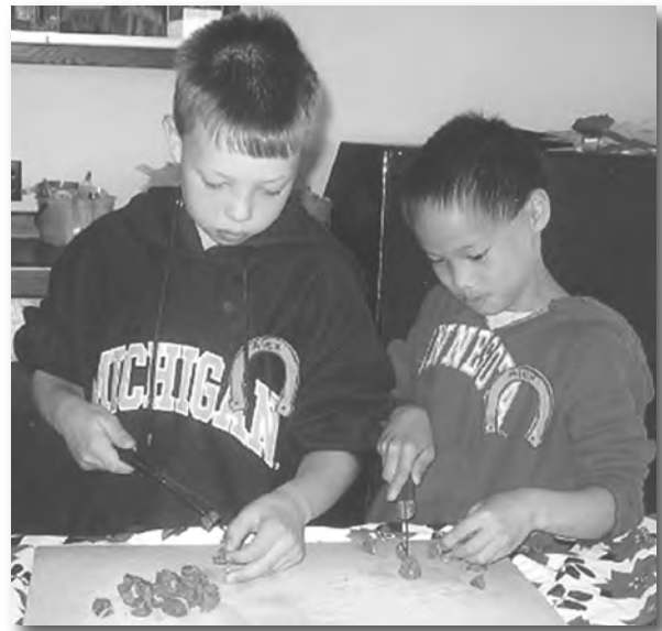
Campers working together