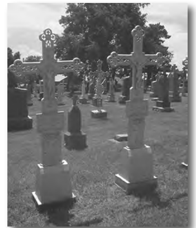
St. Wenceslas cemetery, Tabor

it. They have a small, quaint open-air Czech museum consisting of a few buildings. The historic church of Sv. Vaclav or St. Wenceslas is glorious, and they still sing and say the prayers in the Czech language (this might be the only church still doing this in the USA). The cemetery is spectacular. It has dozens of the old iron grave markers, most in the Czech language, looking very much like the old country. The weekend was marked by beautiful weather, with an occasional prairie thunderstorm and downpour. Warmest of all was the welcome and gratitude of the people of Tabor and our gracious host, Dennis Povondra and his family.