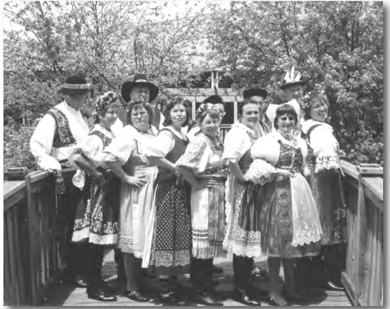
St. Paul Czech and Slovak Folkdancers at Iron World in Chisholm, Minnesota, June 7, 2008.

We also presented a half-hour kroje(folkdress) program in the small theater on the grounds. Some of the dancers had time to explore the exhibits, including one titled "Tangled up in Ore" - about Hibbing native Bob Dylan. We got to take a special tour on the train that takes visitors to the former open pit mine, which is now a beautiful three mile-long lake and to a recreated mine location(town). We also had the chance to sample sarma, a Slovene cabbage roll and potica, a walnut filled pastry. We enjoyed our trip to Ironworld and our audiences enjoyed our dances.