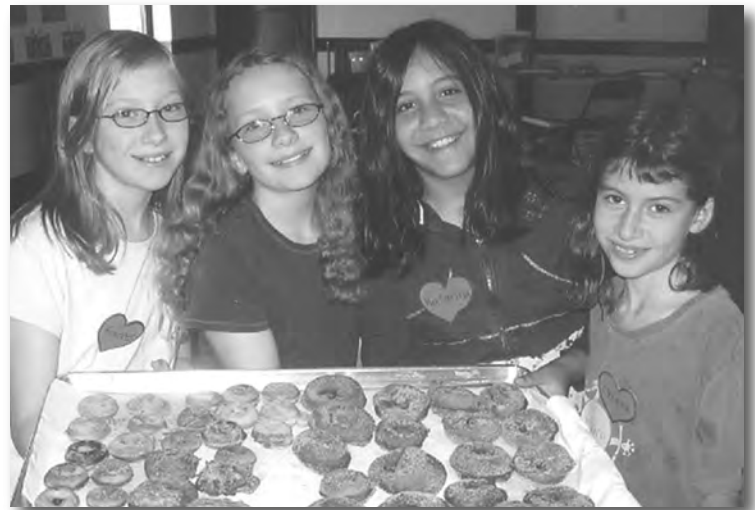
Campers show off the "donuts" they made in camp cooking class.