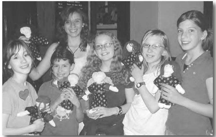
One of the optional craft activities was sewing Czech rag dolls.