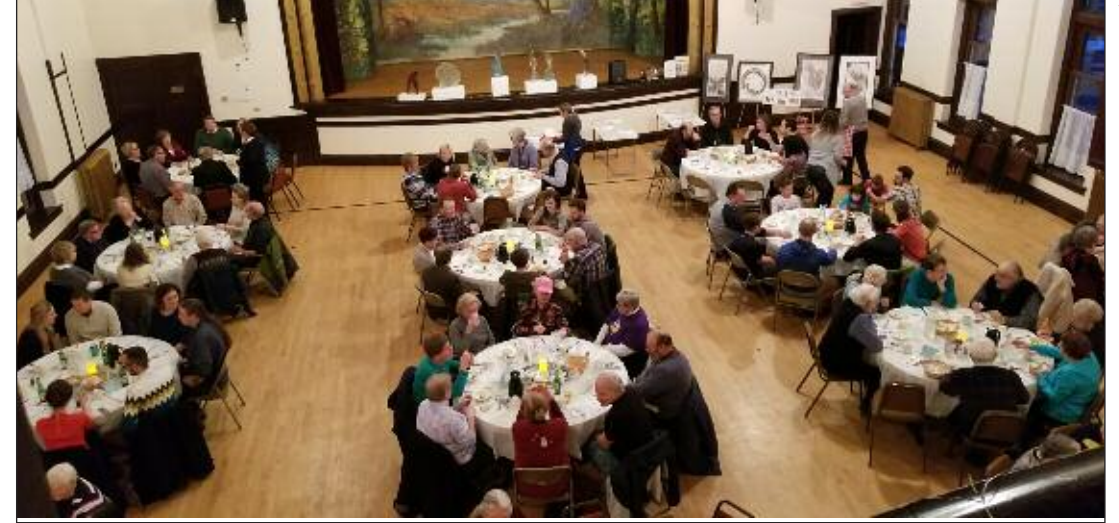
Above top: Half a roast duck and potato dumplings covered with gravy, plus sweet and sour red cabbage with bacon, and apple sauce. Above: The new round dining tables made their debut at the dinner.

The paintings and glass were on display also on Sunday, January 21, for Family Night.