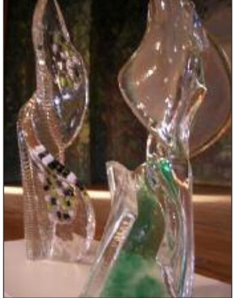
Glass sculptures by Chad Holliday March 2018 Slovo 9