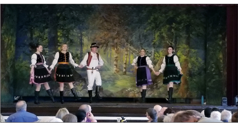
Flavors of Slovakia Dinner guests enjoyed the performance by the Lipa Slovak Folk Dancers.